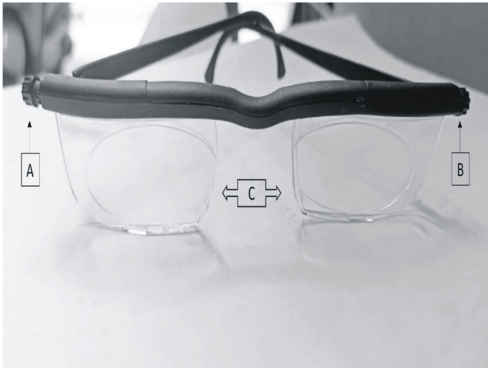
Figure 1: DialVision Eyeglasses

A: Right adjusting knob, B: Left adjusting knob, C: Right and left dual lenses